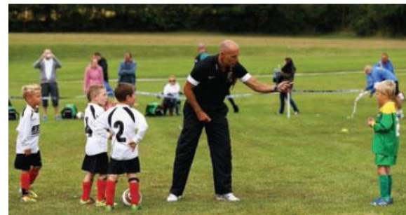
Matt Lewis/The FA Collection/Getty Images