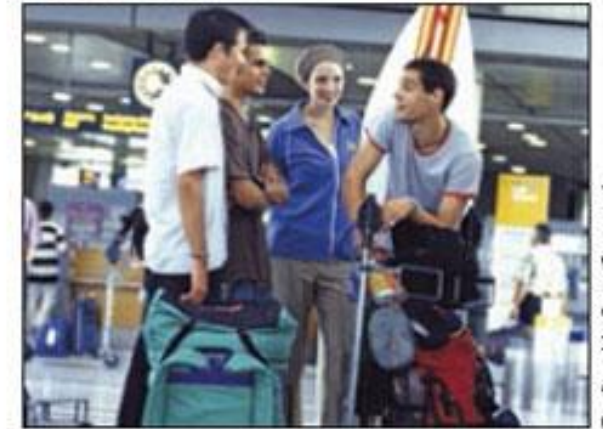
The Copyright Group/Supers took